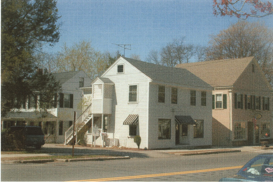
157 Main Street