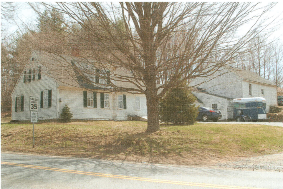
323 Main Street