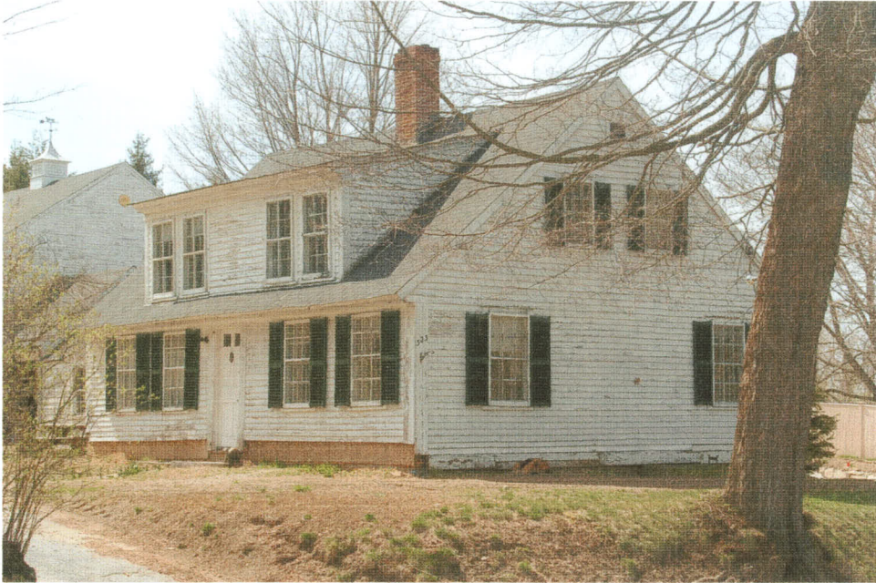
323 Main Street