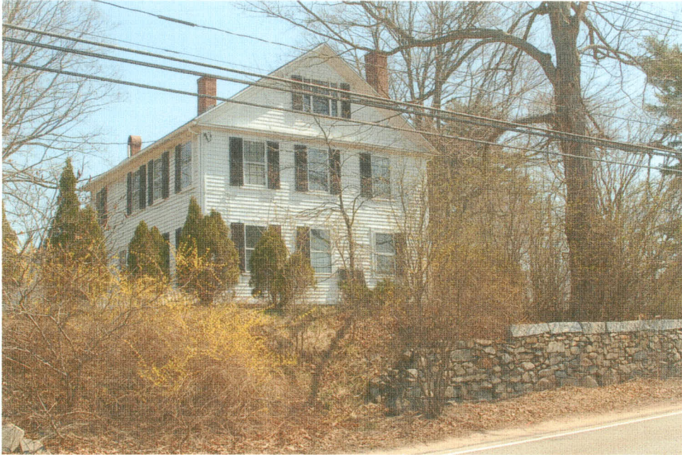
368 Main Street