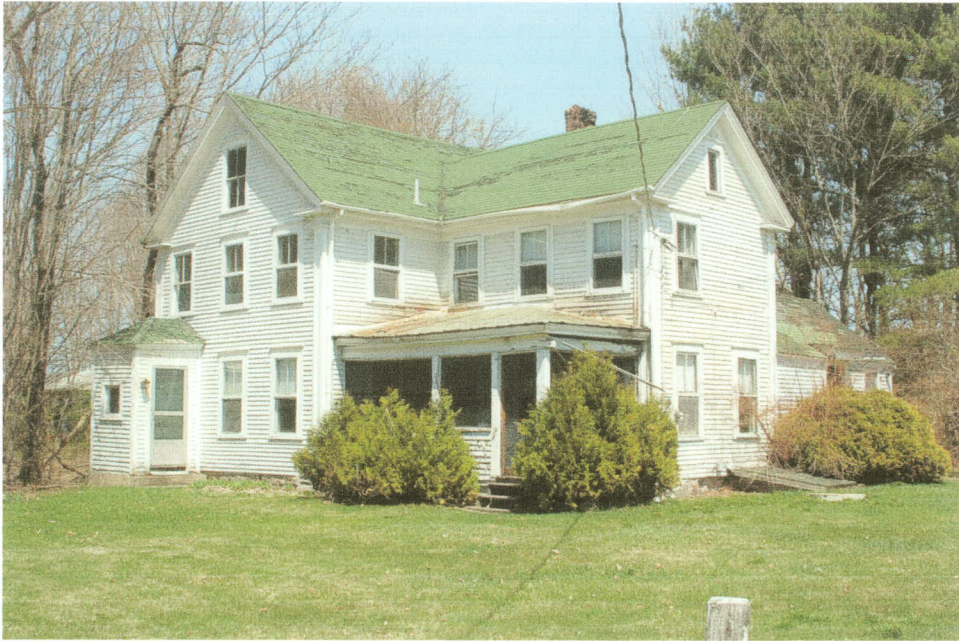
419 Old Ayer Road