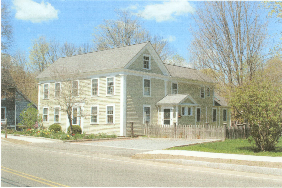
54 Pleasant Street