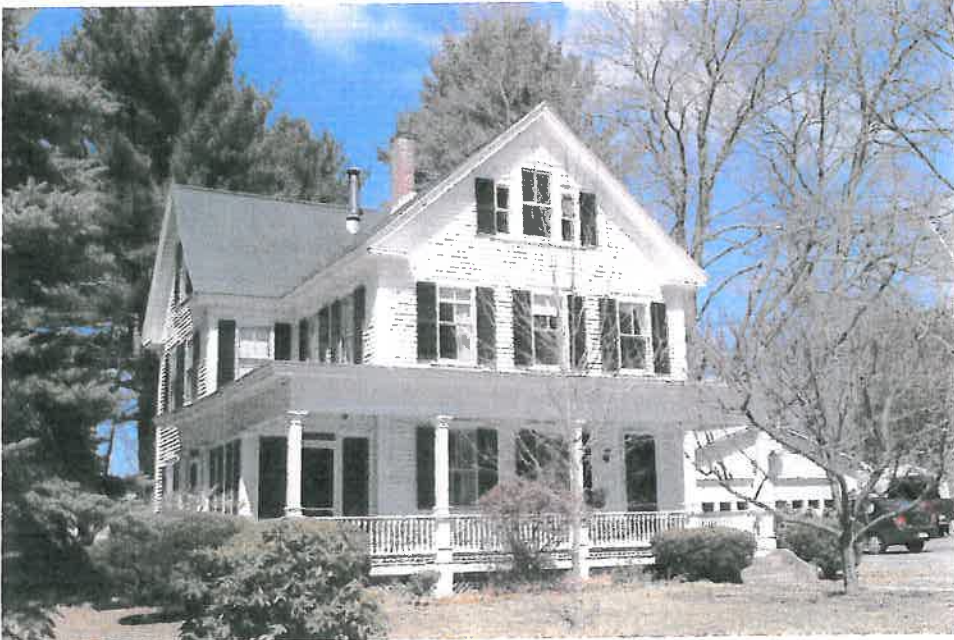
19 Champney St