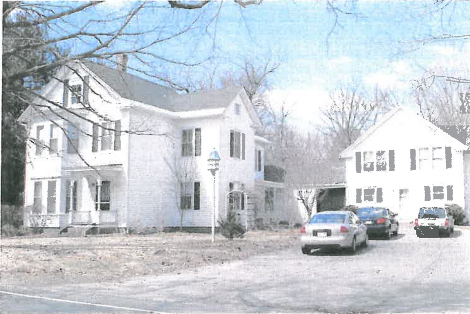
69 Champney St