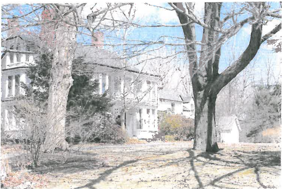
22 Common St