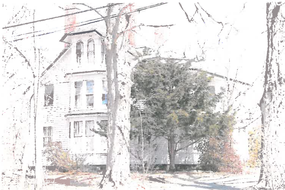
22 Common St