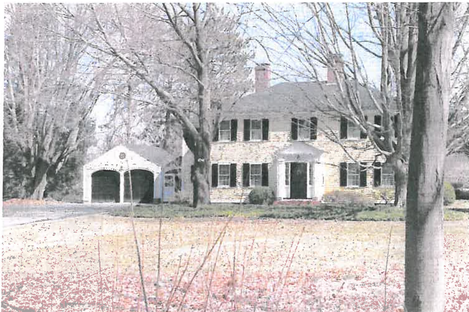
237 Farmers Row, Groton School