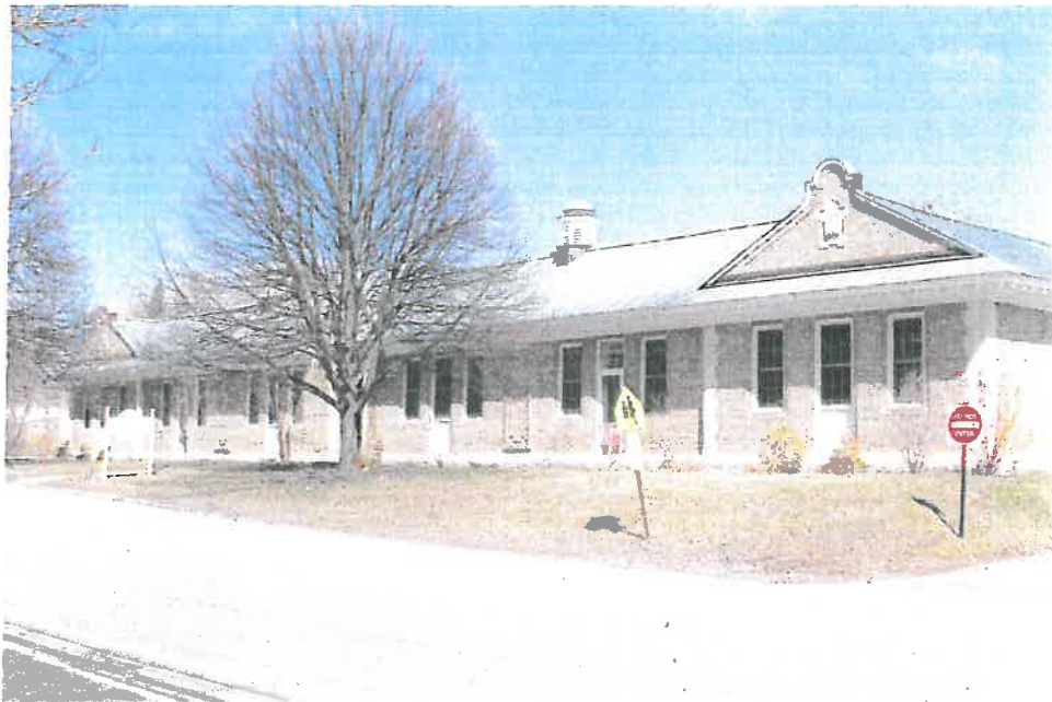
78 Hollis St, Boutwell School