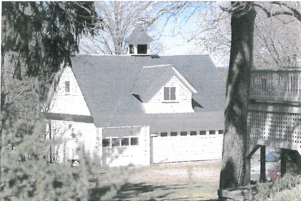
77 Main Street, Loomis House, Lawrence Academy