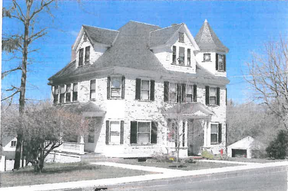
77 Main Street, Loomis House, Lawrence Academy