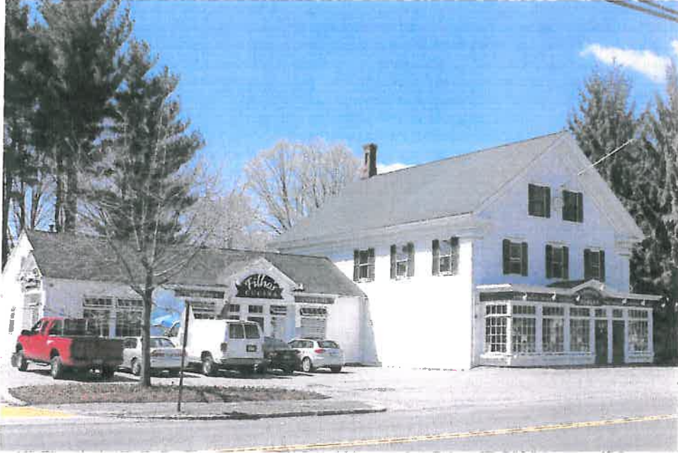
235 Main Street