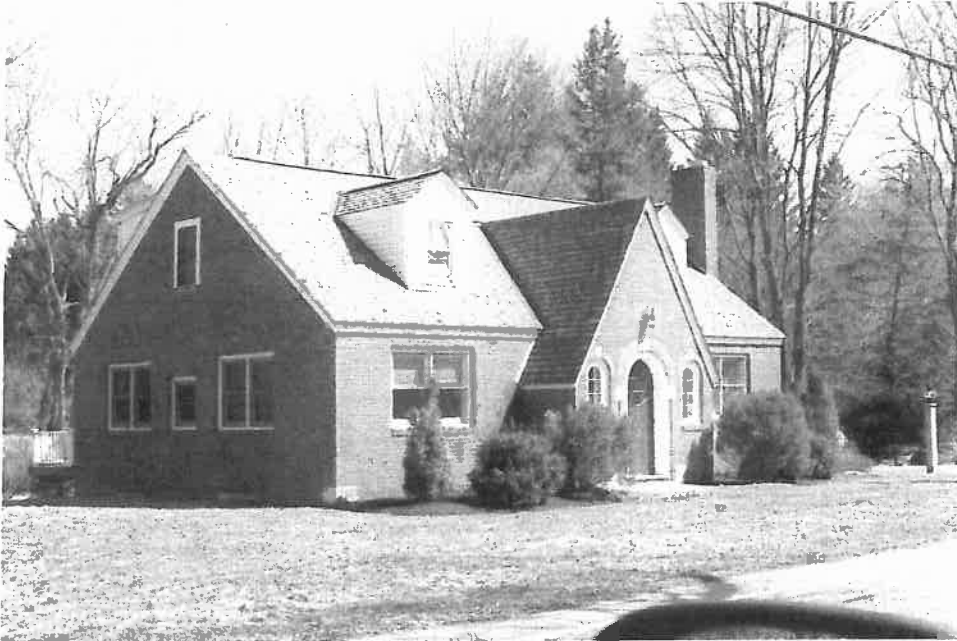
96 Mill St