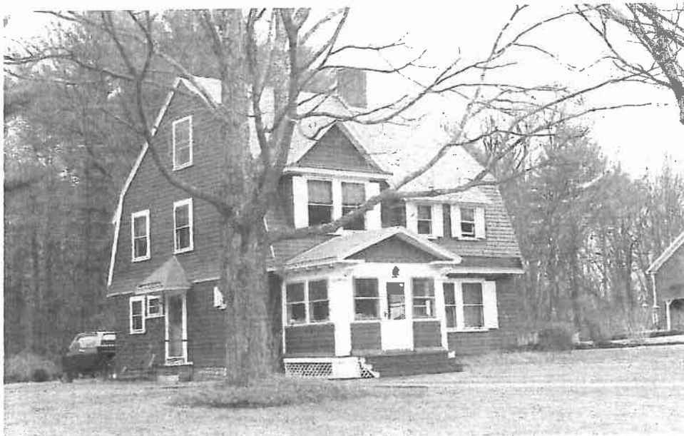
20 Old Orchard St