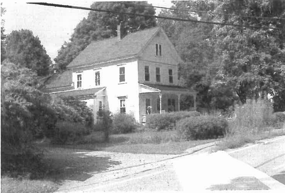
17 Pepperell Road