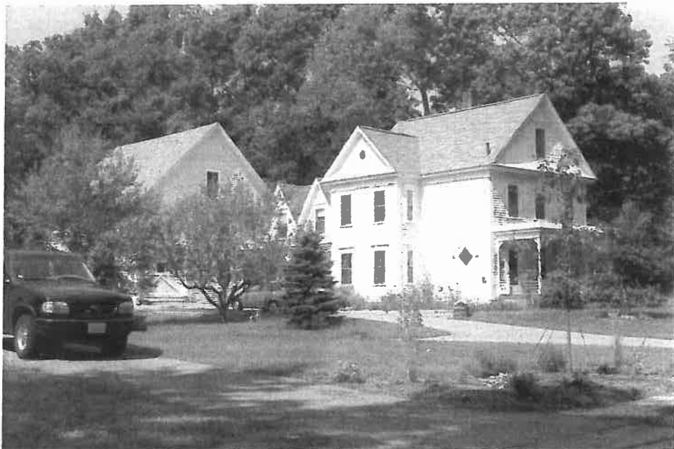
39 Pepperell Road