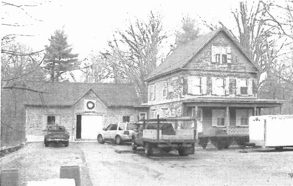
102 Pepperell Road