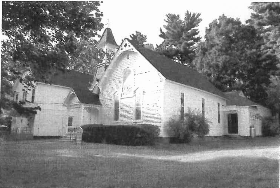
35 West Main St., Christian Union Church