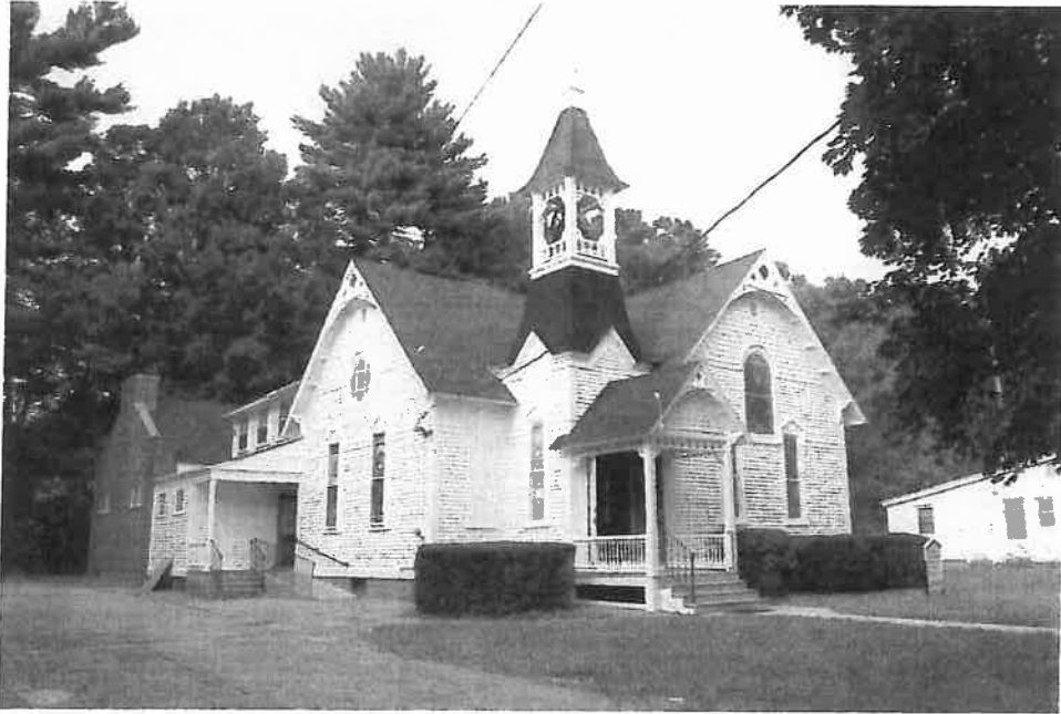
35 West Main St., Christian Union Church