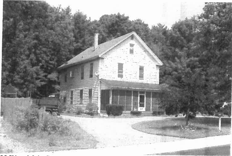
55 West Main Street